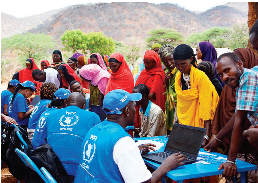
Registration exercise, Marsabit, April 2016

In April, WFP began electronic registration of asset-creation beneficiaries in seven counties: Baringo, Garissa, Isiolo, Marsabit, Samburu, Tana River and Turkana. By May, WFP had registered 26,600 beneficiaries in Moyale and 26,400 beneficiaries in Baringo, adding 53,000 new households to the 74,800 asset-creation households already in the Single Registry. The registration is a joint undertaking of UNICEF and WFP and includes collecting information on vulnerable children to help inform potential programme layering and is also an emergency preparedness measure.