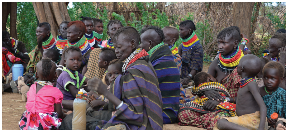
Crowd gathered at a community-based targeting exercise, Namon.

If Kenya continues to move forward with an inclusive life cycle social protection system, which is a much better way of dealing with vulnerability,