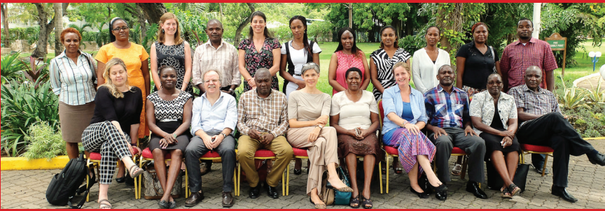
The UNDAF Social Protection Group, April 2016

In April, WFP hosted a three-day mid-term review meeting with fellow United Nations agencies, the Ministry