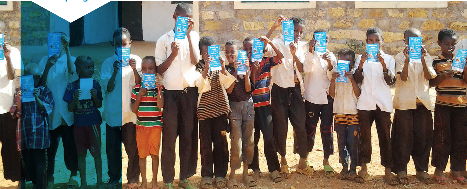
Primary school children in Mandera receive Helpline leaflets